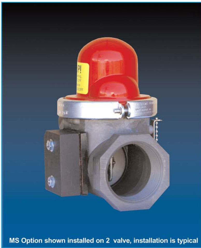
MS Option shown installed on 2" valve, installation is typical

The new Model MS Monitoring Switch is an optional feature that is available at the time of order with any CALIFORNIA valve. This unique device relays an electrical signal that enables the valve's open or closed position to be monitored remotely. It is mounted by the factory on the side of the valve, and does not interfere with the position-indicator window with the green and red tags.